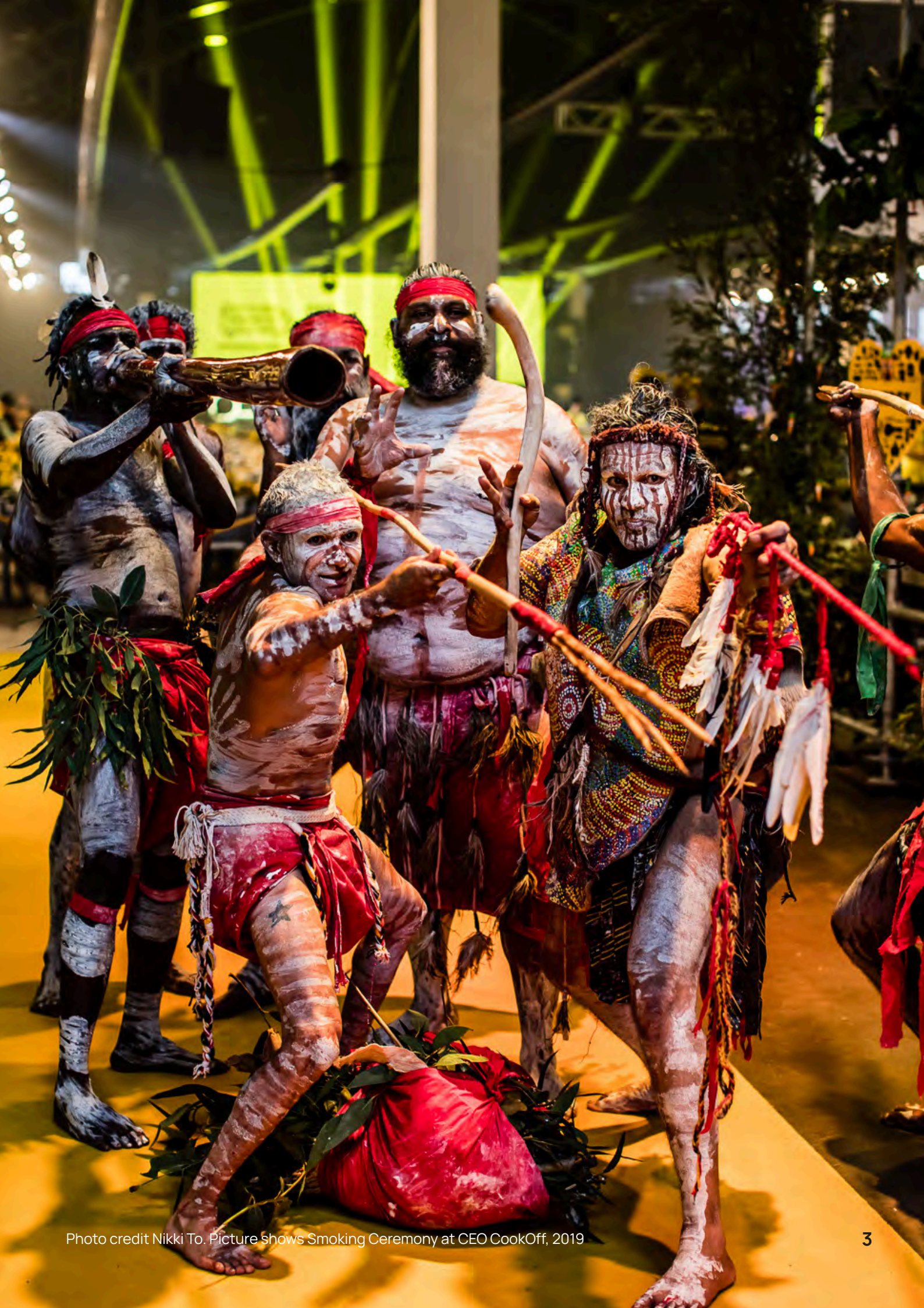
Picture shows Smoking Ceremony at CEO CookOff, 2019