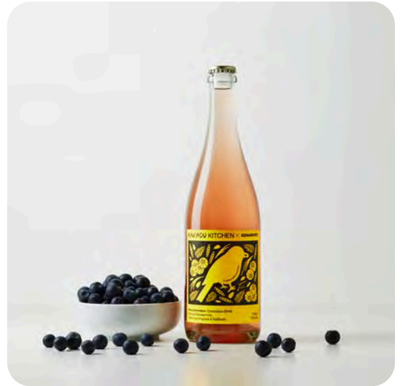
Picture shows Kakadu Kitchen x OzHarvest Conscious Drink