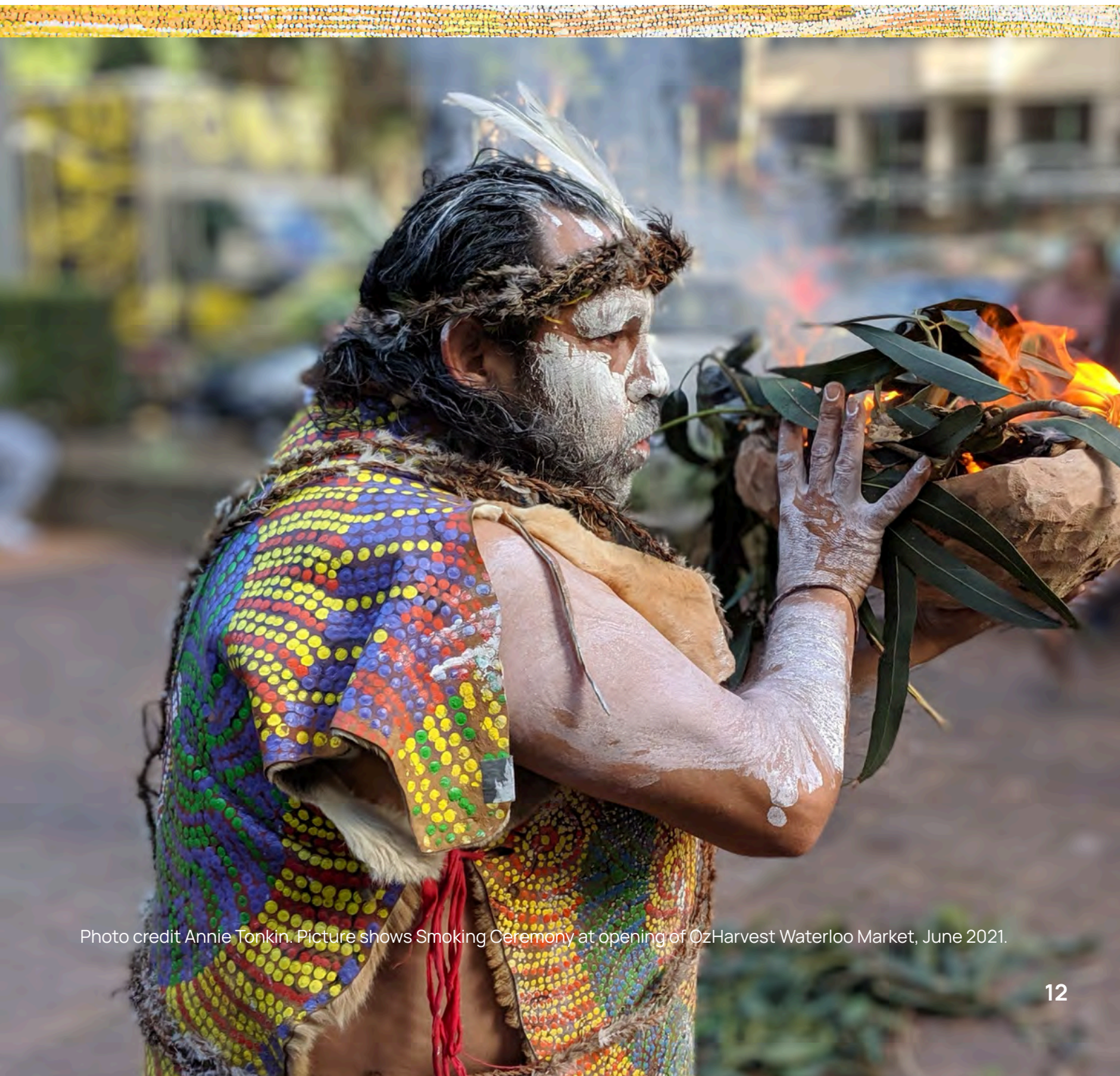
Picture shows Smoking Ceremony at opening of OzHarvest Waterloo Market, June 2021.

OzHarvest's reconciliation journey to date has been informal but meaningful. Over the years, we have supported Aboriginal and Torres Strait Islander communities through food rescue, food relief, and engagement via our programs. While this journey has not been formally structured, we have built strong collaborations with various First Nations-led community groups across the country. With the establishment of our RAP, OzHarvest is prioritising reconciliation within our Environmental, Social, and Governance (ESG) commitments. We are dedicating time, resources, and a renewed focus to engage more deeply and strengthen our relationships with Aboriginal and Torres Strait Islander communities to work towards intentional and meaningful progress towards reconciliation in the years ahead.