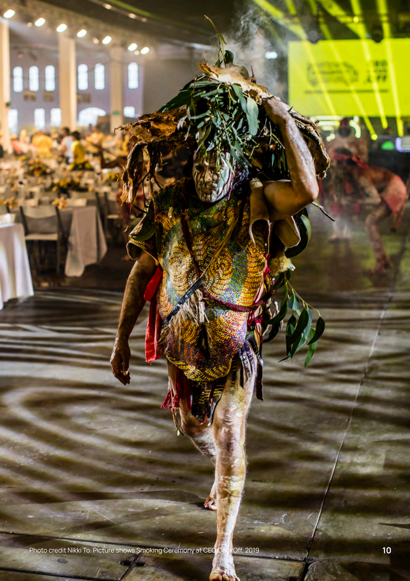
Picture shows Smoking Ceremony at CEO CookOff, 2019